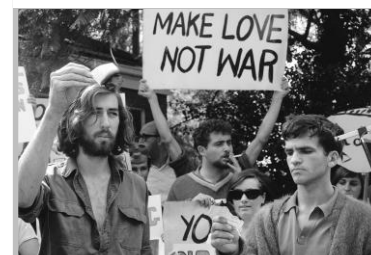
War in Vietnam