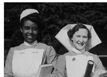
Migration through History