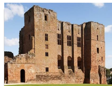
The Historic Environment