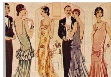
The Roaring 20s