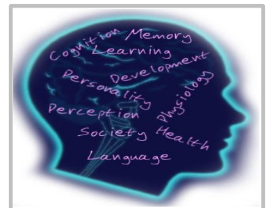
Parts of the Human Brain

There are lots of other applied psychology careers such as sport and health psychology. Not all Psychology graduates become psychologists, many will enter the world of business, journalism, politics and social work. Of course psychologists can become teachers as well.