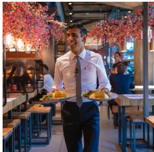
Rishi Sunak - Ready to serve us all.