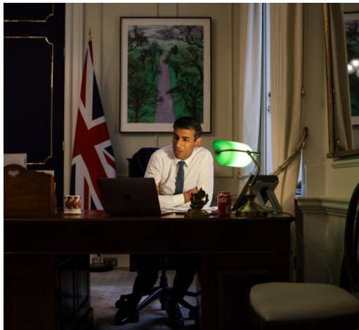
Mr Sunak working hard late in to the night.

The 42-year-old recently became the country's youngest prime minister in more than 200 years, solidifying his position in history. There is no doubt that he will go down in history as he became the first politician of South Asian descent to move in to 10 Downing Street.