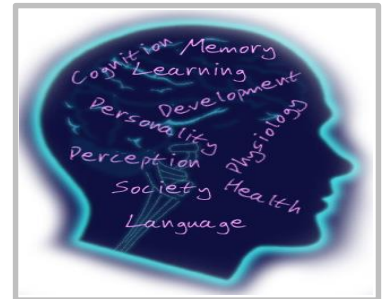
Parts of the Human Brain

There are lots of other applied psychology careers such as sport and health psychology. Not all Psychology graduates become psychologists, many will enter the world of business, journalism, politics and social work. Of course psychologists can become teachers as well.