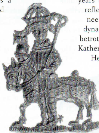
Above A saint in the family: this lead pilgrim's badge of Henry VI with heavenly orb and sceptre is one of many testifying to the cult's popularity under the Tudor king.

By the standards of his time, the king was remarkably merciful in dealing with those who threatened his throne. Even the persistent Perkin Warbeck was given several chances. Only Spanish insistence on all pretenders