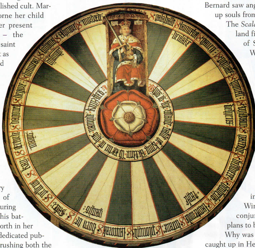
Above King Arthur's Round Table (in fact dated to c. 1290), Winchester. Henry Tudor ensured his firstborn – luckily a son whom he could name Arthur – was born there. The table was subsequently overpainted with a Tudor rose emphasising the association. Below Arthur, Prince of Wales, wearing a collar of red and white Tudor roses in a painting c.1500.

during the Channel storms of 1483 and again in 1485 for safe landing in Wales, had his feast day added to the Church calendar in 1498.