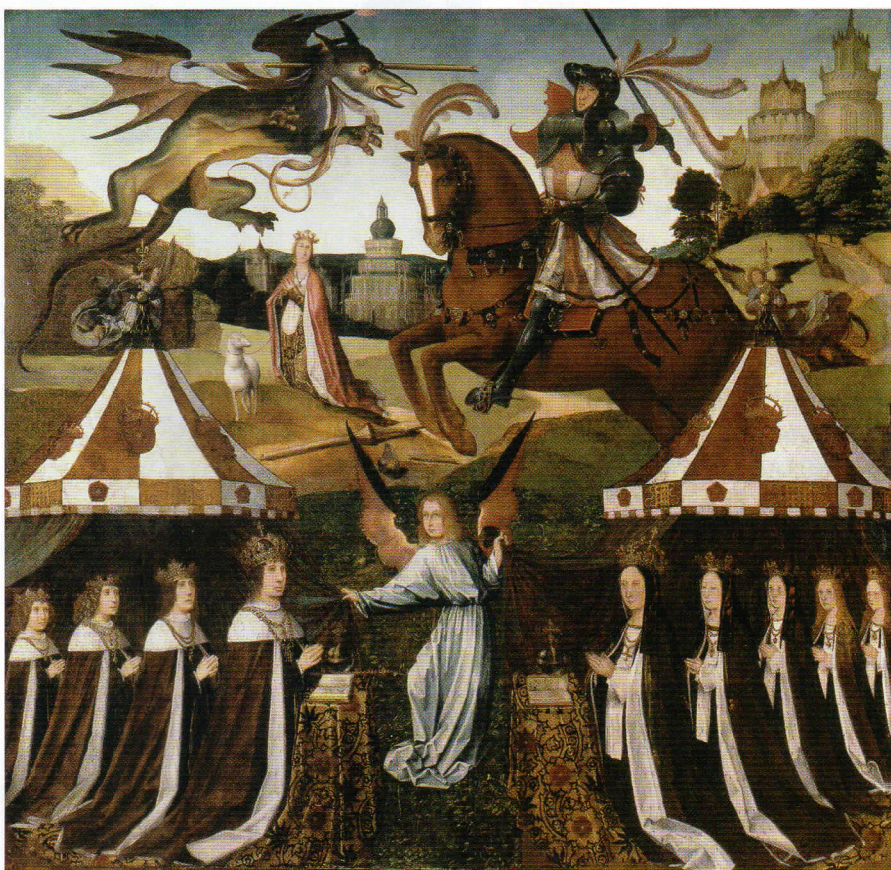
Above This dynastic portrait shows Henry VII, his wife Elizabeth of York and their children under the protection of the Archangel Michael and England's patron saint George – with dragon. The imagery links the Tudors with the cultivation of the saint by Henry's Plantaganet predecessors but also with endorsement by the 'God of Battles'.

“everyone in 15th-century Europe saw Providence as playing some role in success or failure of the events taking place”