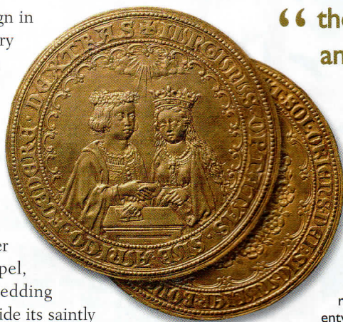
Left A medallion of 1486 commemorating the marriage of Henry and Elizabeth of York. The reverse is decorated with the entwined roses of York and Lancaster.

Come hither England's hope – This pretty lad will prove our country's bliss ... His head by nature framed to wear a crown.