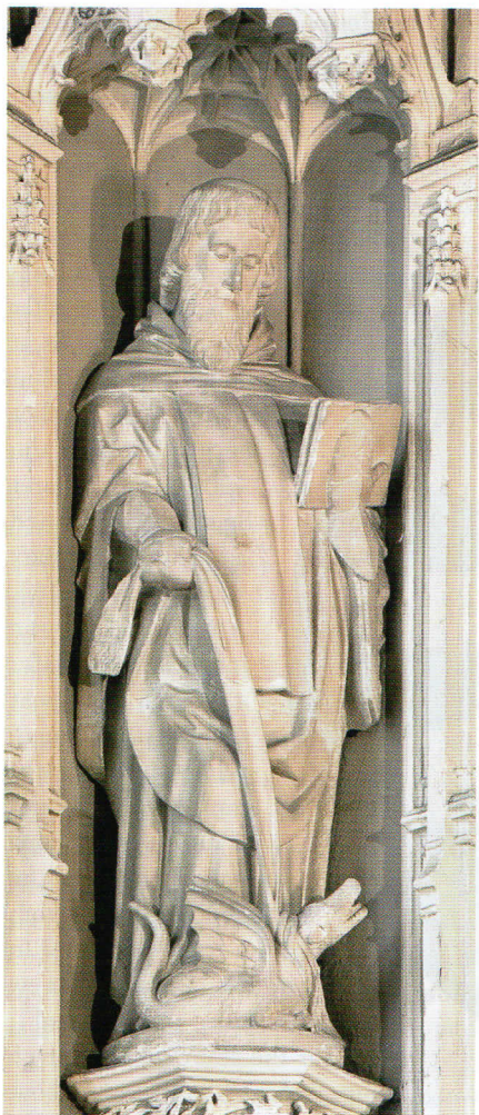
Above St Armel's statue in Henry VII's Chapel at Westminster. The King believed the saint had interceded to save him from shipwreck off the coast of Brittany.