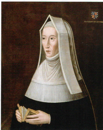
Above Henry's relationship with his mother Margaret of Beaufort was intense – she died six weeks after him in 1509. The close bond between mother and son extended to joint devotion to new cults like the Scala Coeli – 'Staircase to Heaven' – for whom Margaret established a chantry at Westminster in the chapel of Mary de la Puwe below in 1494.

Without the dogged loyalty shown from the 1460s onwards by his uncle Jasper and John de Vere, the warrior Earl of Oxford, Henry would never have got to Bosworth. He knew it, and as king the pivotal roles he awarded both men reflected this. Jasper Tudor's power base in west Wales gave his nephew the essential springboard to confront Richard III. Owen Tudor's love match with Catherine of Valois would have led nowhere in garnering Welsh support had not the national sentiment been kept alive by the bards after Owen Glendower's revolt in 1400 against Henry IV's English rule. Jasper was particularly well placed to do this. As a patron of the bards since the 1450s, he attracted the title of mab darogan (son of Prophecy), a title which then transferred to his nephew in his challenge to the English usurper. Henry was cast in the role of a returning avenger by bards like Dafydd Llwyd of Mathafarn, who denounced Richard III as murderer of the princes in the Tower, 'the hang-lipped Saracen slaying the angels of Christ'. Henry could also be seen as the fulfiller of prophecy as the last of the line of Brutus, legendary