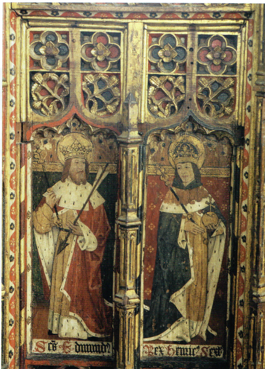
Right The East Anglian St Edmund is paired with Henry VI on the rood screen at St Catherine's Church, Ludham in Norfolk.

in a water mill was by the invocation of the blessed Henry VI revived from the dead'. It dates from 1481, two years before Edward IV's death. Richard III, in an attempt to depoliticise the cult and expiate the sin of regicide, had Henry VI's body moved from Chertsey Abbey to a prestigious tomb in the new St George's Chapel at Windsor in August 1484.