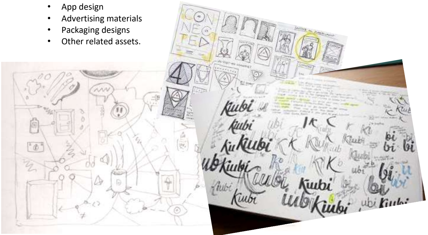
Example of design proposals